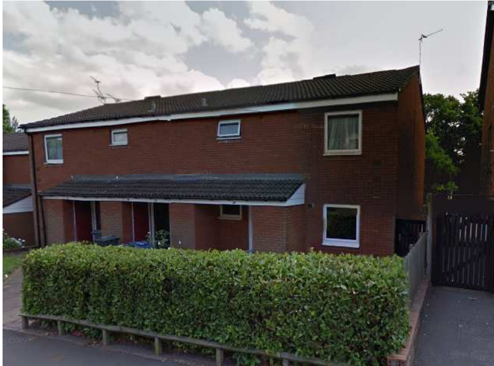
The site of Westwood House today.