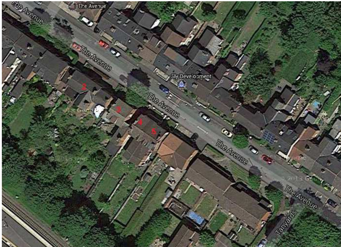
The houses that appear to the right of number 5 are modern houses. The 1887 Ordnance Survey shows that entry number 8 was located opposite what is now Oxford House.