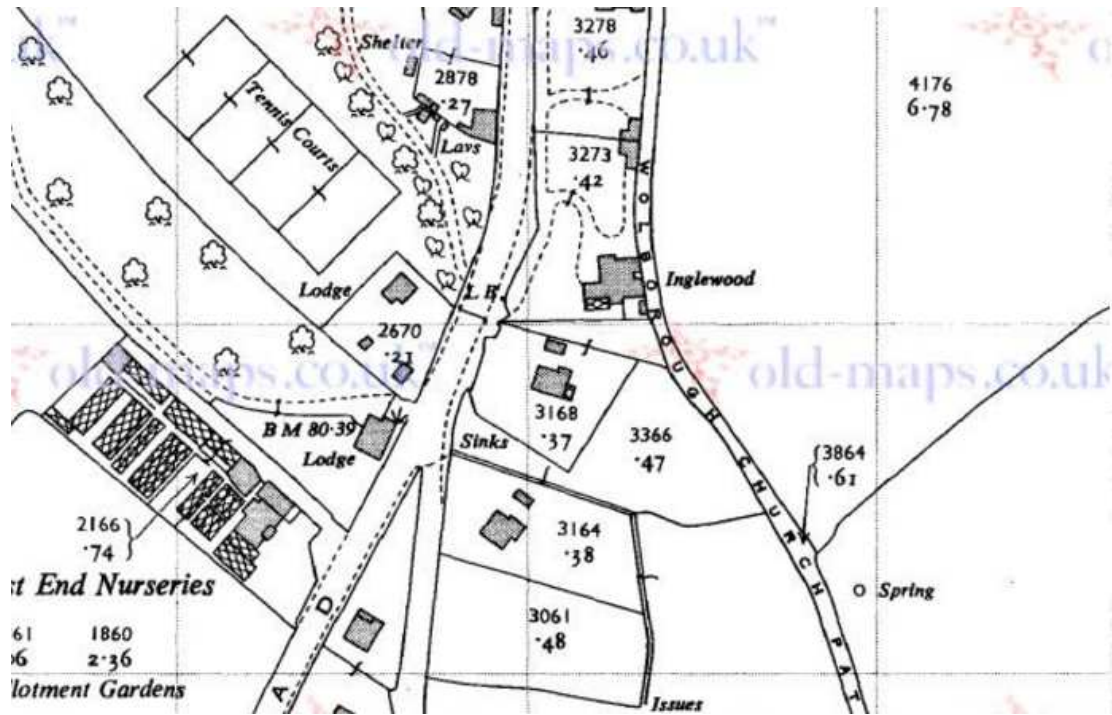
Inglewood shown in the 1956 Ordnance Survey (opposite the tennis courts).