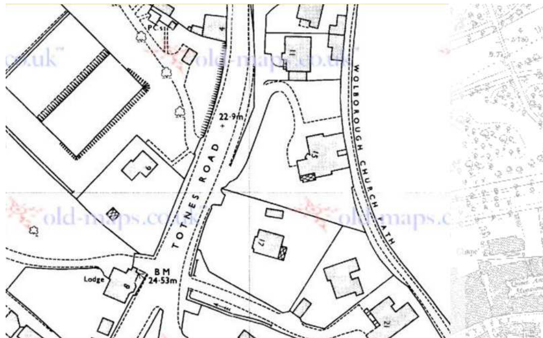
Inglewood shown in the 1981-1982 Ordnance Survey (opposite the tennis courts, now classified as number 15).