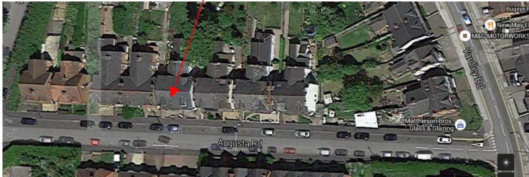
Current number 16

Applying this method on a map from 2015, we can see that the current number 16 is situated 9 houses from the left (Wynford Road) and 8 houses from the right (Yardley Road) in the 5 th block. This has to be the same house that Robert & Eleanor lived in.